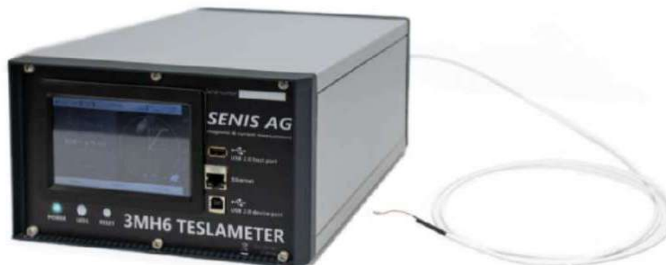
Figure 1: 3MH6 Teslameter