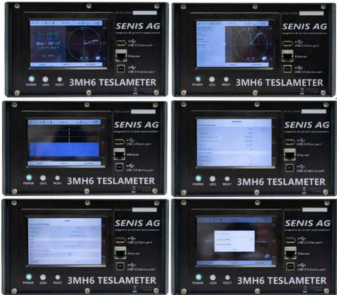
Figure 4: Visualization Modes (Numeric, Plot, Histogram) and Setting possibilities; External/Internal Triggers; Data Recording; Auto range; Zeroing; Min/Max; Hold reading;